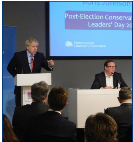
The Prime Minister taking questions from CCA Members at the Group Leaders' Day 2019.

The number of Cabinet members will vary from authority to authority, but it will include the Leader of the Council and senior councillors responsible for particular aspects of policy (housing, education, etc). These are known as 'portfolio holders'. Portfolio holders work closely with council officers and are responsible for the specific details of their brief as well as ensuring the implementation of agreed policy decisions. As these decisions affect the level and quality of